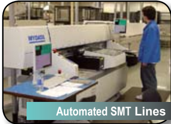
Automated SMT Lines

The document control system at Matric captures printed circuit board data directly from a wide variety of Computer Aided Design (CAD) files. CAD data is used to generate documentation to create bills of material and to program equipment. From data capture to product delivery, Matric is the first choice for quality electronic manufacturing services.