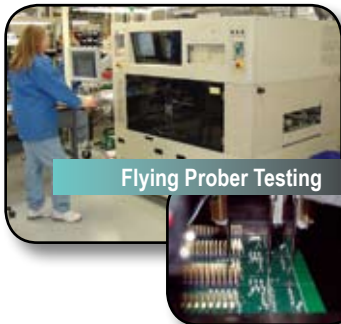
Flying Prober Testing